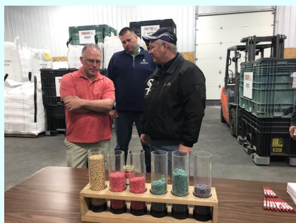
Conserv FS employees discuss with Senator Craig Wilcox the importance of seeds treatments to farmers and ag retailers.