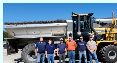
Northern Partners in Peru hosted Rep. Lance Yednock at their new barge fertilizer/grain facility.